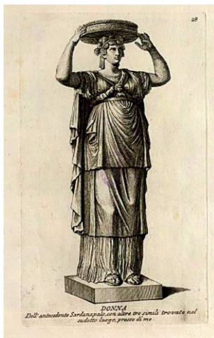
Fig. 1. Engraving of a sculpture now in the Torlonia Collection from Cavaceppi's Raccolta , circa 1768, Rome